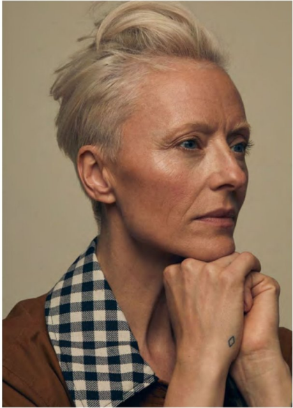
Coat: Barbour x Alexa Chung @alexachung @barbour